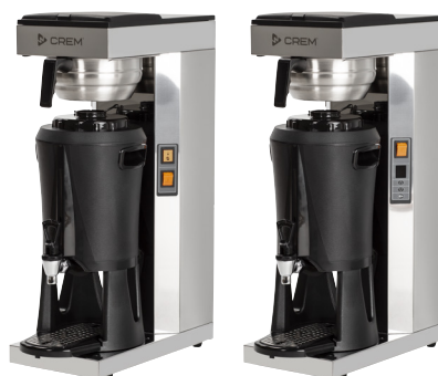
Mega Gold M