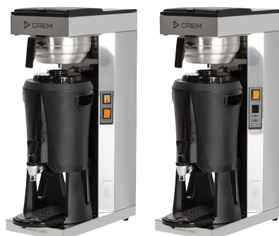
Mega Gold M TK-Series