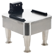
1SH STAND, CE 220-240V INF SERIES