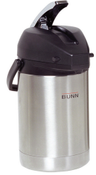
AIRPOT, 2.5L SST LA SINGLE PK