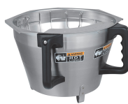
FUNNEL ASSY W/ BASKET, TITAN