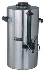
TITAN TF SERVER, VERTICAL FCT