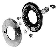
BURR SET KIT, NEW