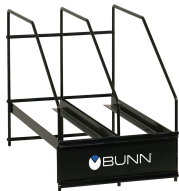
HOPPER RACK, MHG 2 POSITION